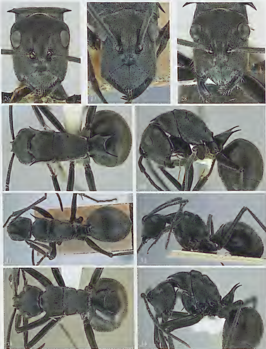
Figs 26-34. Polyrhachis spp. (26, 29-30) P. planocolata sp. n. (holotype): (26) head in full face view; (29) dorsal view; (30) lateral view. (27, 31-32) P. procera Emery (syntype): (27) head in full face view; (31) dorsal view; (32) lateral view. (28, 33-34) P. pulleni sp. n. (holotype): (28) head in full face view; (33) dorsal view; (34) lateral view. Not to scale.

towards apices. Legs dark reddish brown, tarsi a shade darker. Gastral venter and apex reddish brown.